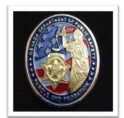
Division Commemorative "Challenge" Coins