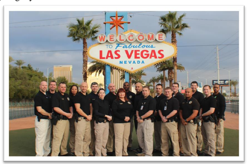
Parole and Probation Officers - Las Vegas, NV