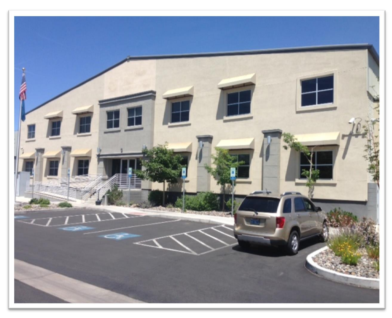
Parole and Probation Office Reno, NV