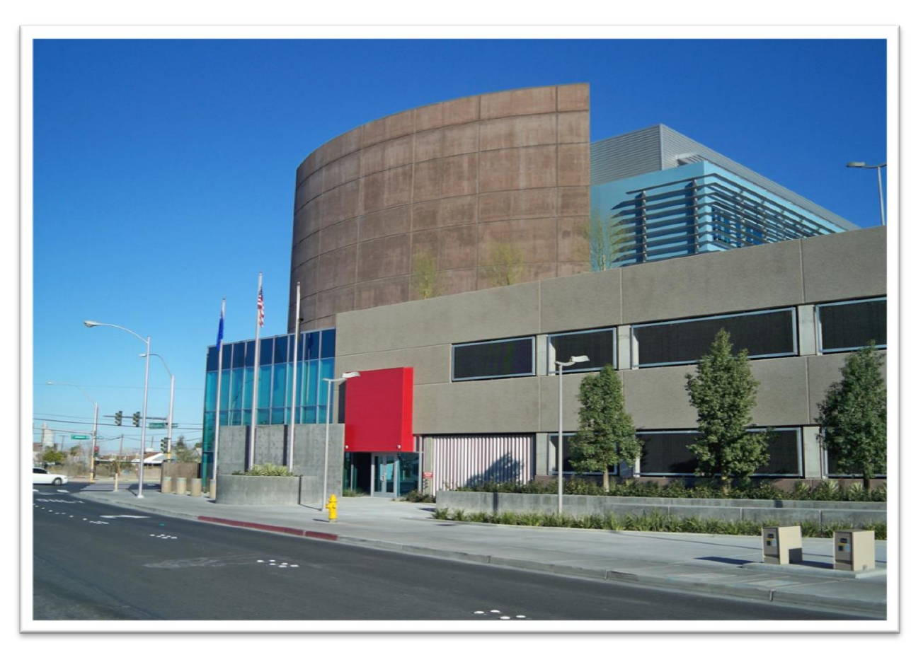
Parole and Probation Office Las Vegas, NV